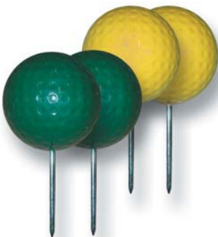
Tee Markers: $20 pair

The individual hole yardage for the Red Tee course need not be changed from the original design if the total yardage does not exceed 2500 yards per nine holes by 10%.